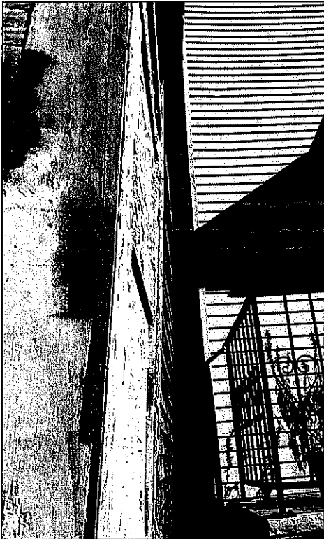
Detail of building lean towards adjacent structure.