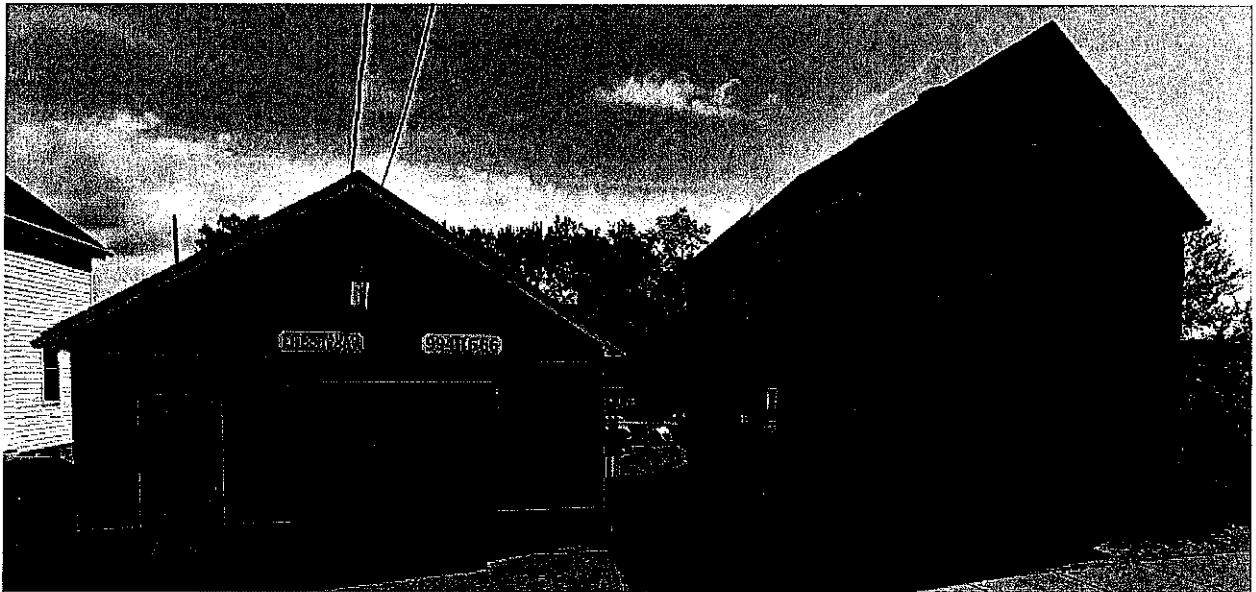
Building Condition Detail