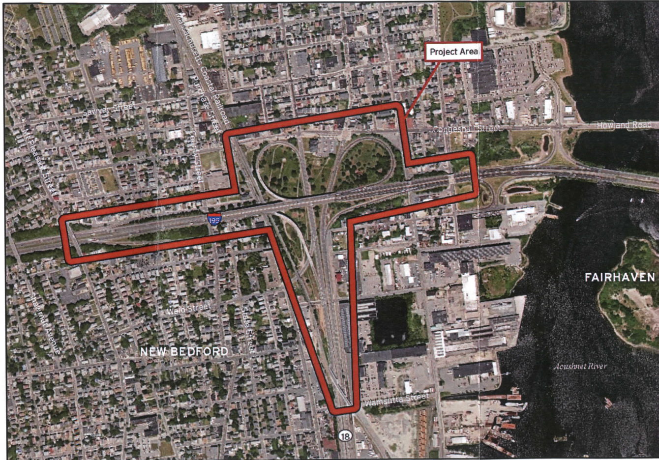
Route I-195 to Route 18 Interchange Rehabilitation Project New Bedford, MA