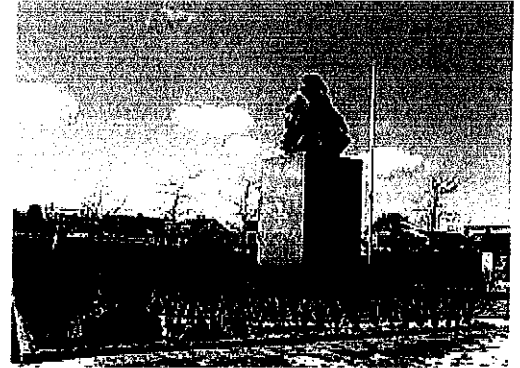
Prince Henry the Navigator Park

The park consists of a large granite and bronze statue in tribute to Prince Henry the Navigator. There is also a stone plaque, a walkway, and a parking and viewing area from which tourists can view New Bedford harbor.