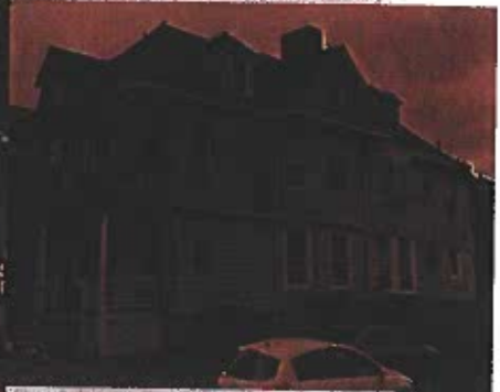
17 Robeson Street

Demolition Request: Removal of two story bay on east façade.