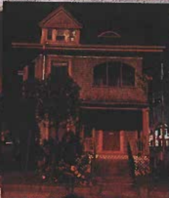
23 Robeson Street