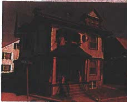
27 Robeson Street