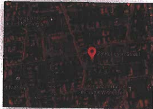
23 Robeson Street Locus Map