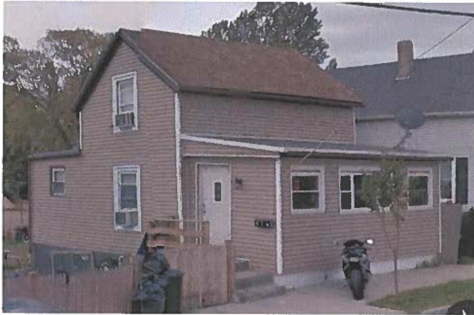
516 Maxfield Street – Current Condition