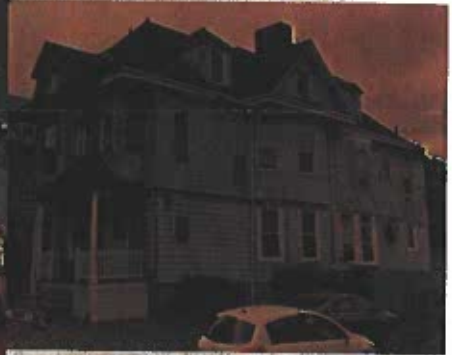
17 Robeson Street

Demolition Request: Removal of two story bay on east façade.