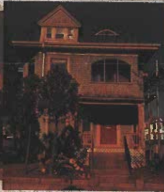
23 Robeson Street