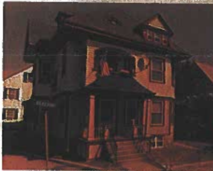
27 Robeson Street