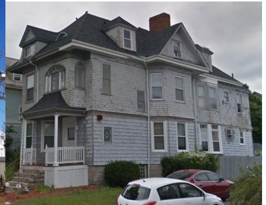
17 Robeson Street

Demolition Request: Removal of two story bay on east façade.