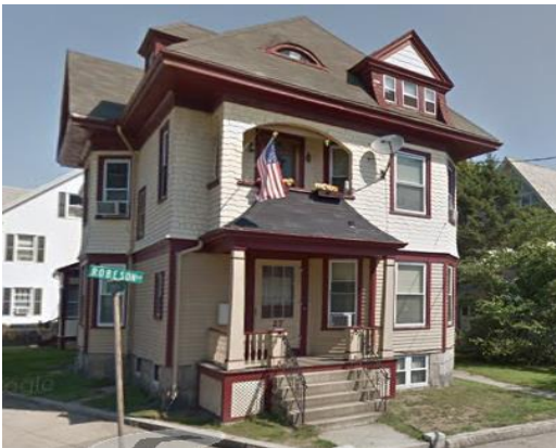
27 Robeson Street