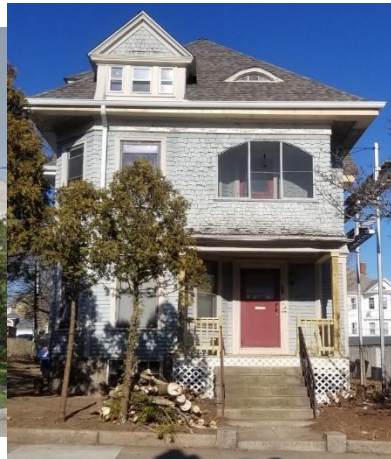
23 Robeson Street