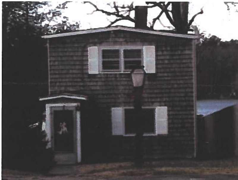
1489 Morton Avenue