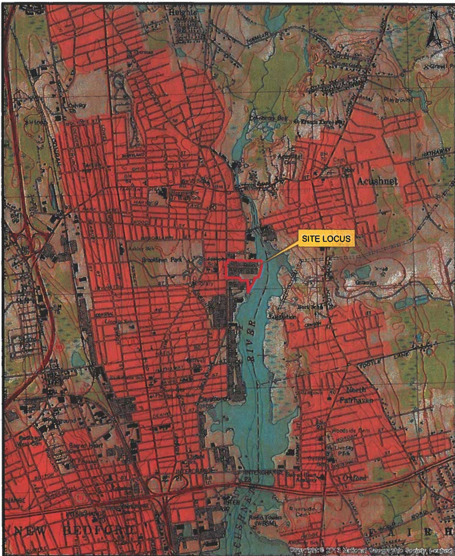
FIGURE 1 SITE LOCATION MAP FORMER AEROVOX FACILITY 740 BELLEVILLE AVENUE NEW BEDFORD, MASSACHUSETTS