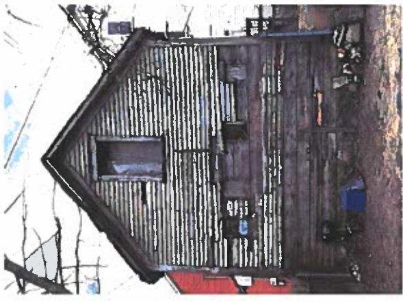
Circa 1900 Carriage Shed South and North Facades