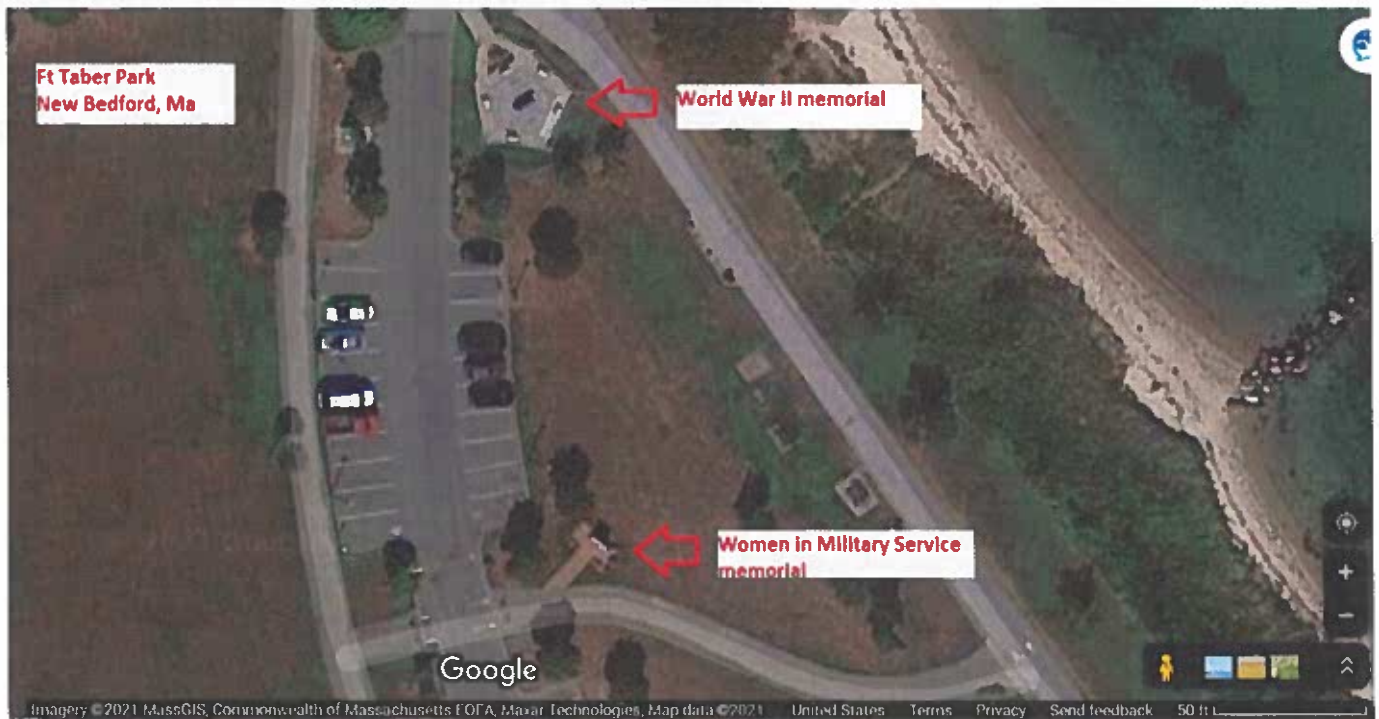
Location of Women in Military Service Memorial to Proximity of World War II Memorial