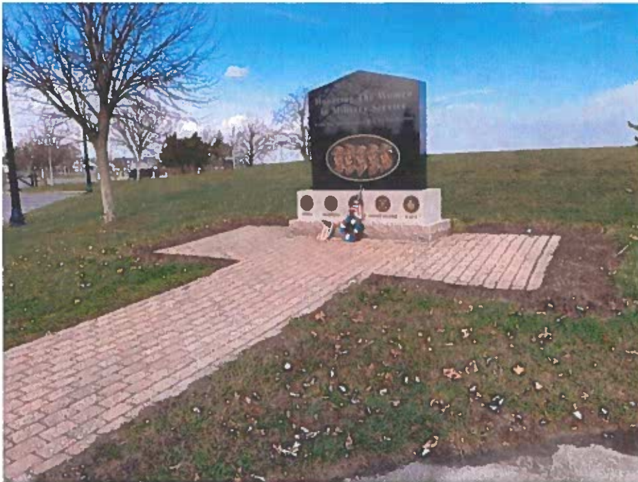
Women in Military Service Memorial