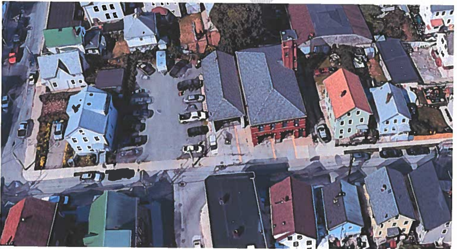
FIRE STATION #6 151 Purchase Street

The City of New Bedford (“the City”) seeks sealed proposals from qualified parties for the purchase and redevelopment of the former Fire Station #6 property, a .3371 acre site comprised of three parcels located in a mixed-use and residential neighborhood in New Bedford’s south end. The site includes a circa 1882 brick firehouse, a contemporary single bay garage, and an asphalt parking area, situated on an approximately .3371 acres, more or less, and is located at 151 Purchase Street, New Bedford. The property is identified on the New Bedford’s Assessors Records as Map 30 Lots 142, 336 and 338. The building is currently vacant. The City’s objective for the property is for its rehabilitation and adaptive reuse in a manner that is compatible and contributes to the neighborhood and generates property tax revenue in the long term. In addition, the building shall be retained and rehabilitated following the Secretary of the Interior Standards for Rehabilitation. The property is currently zoned for Mixed Use Business.