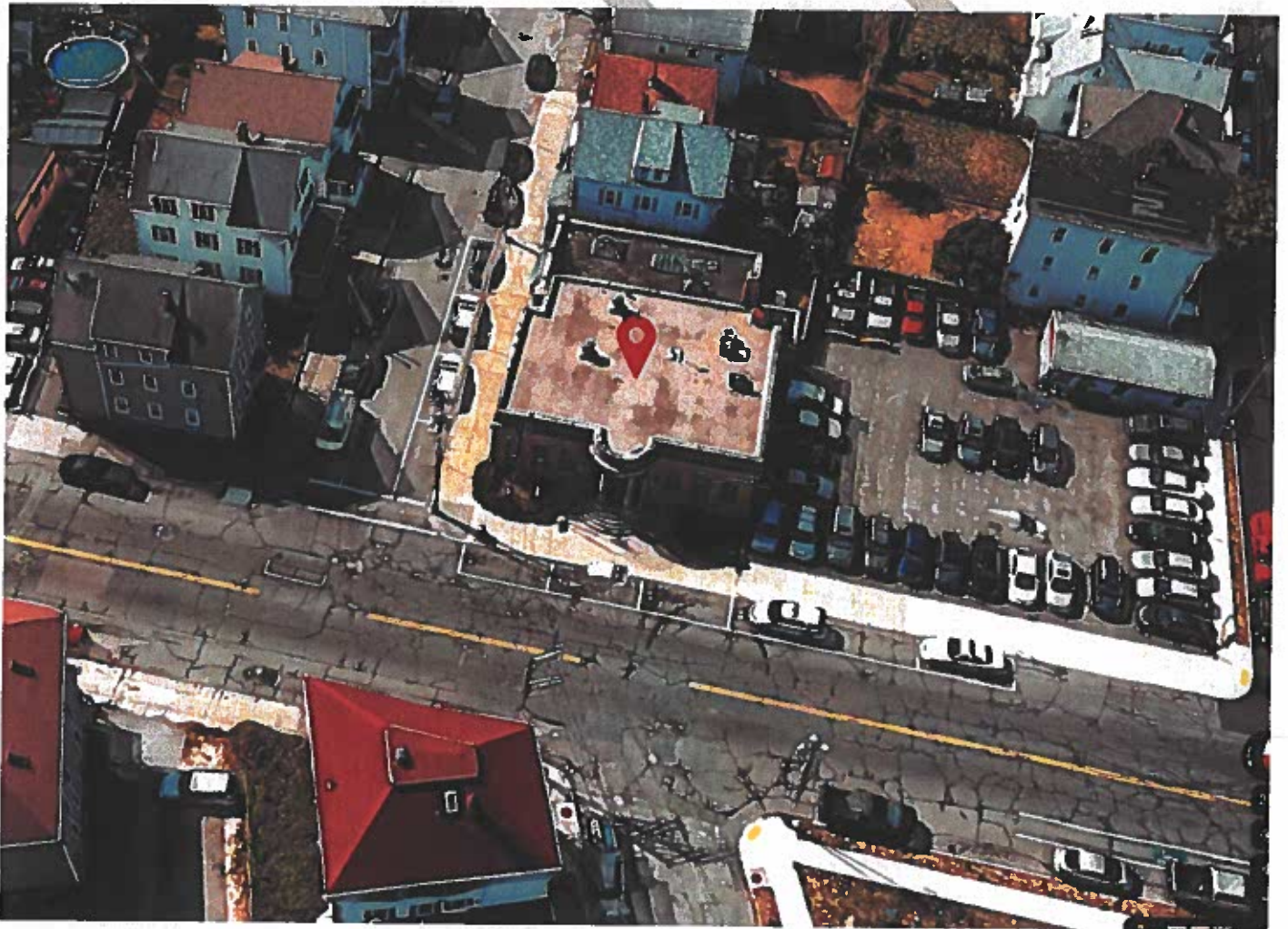
POLICE STATION #2 170 Cove Street

The City of New Bedford (“the City”) seeks sealed proposals from qualified parties for the purchase and redevelopment of the former Police Station #2 property, a .1366 acre parcel located in a mixed use and residential neighborhood in New Bedford’s south end. The parcel consists of a circa 1926 building situated on approximately .1366 acres, more or less, and is located at 170 Cove Street, New Bedford. It is located in a Mixed-Use Business zoning district. The property is identified on the New Bedford’s Assessors Records as Map 20 Lot 139. The building is currently vacant. The City’s objective for the property is for its rehabilitation and adaptive reuse in a manner that is compatible and contributes to the neighborhood business.